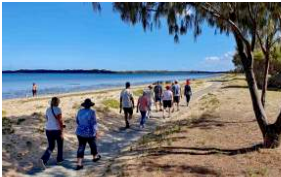
Early birds out for a riverside walk around Eaton.