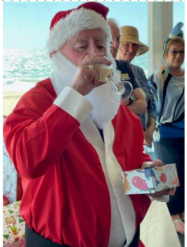
It was too much for Santa. He needed a drink!