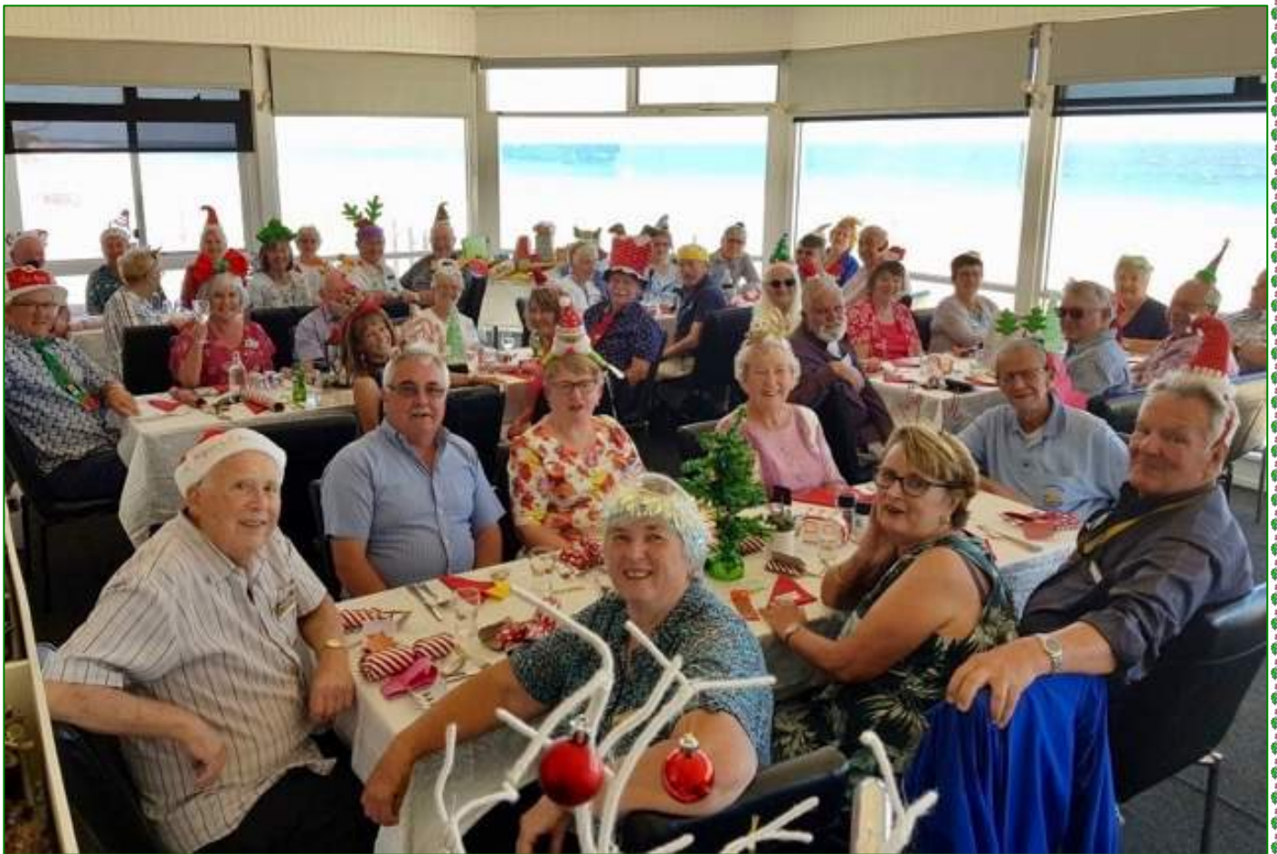
Sandgroper's enjoyed a sumptuous Christmas Lunch at the Backbeach Café in Bunbury