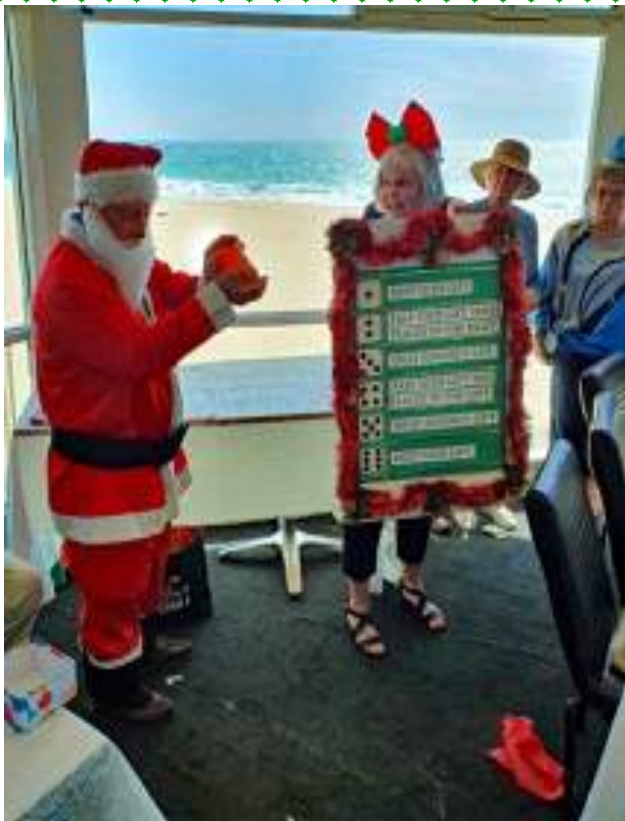
Let the fun and games begin!