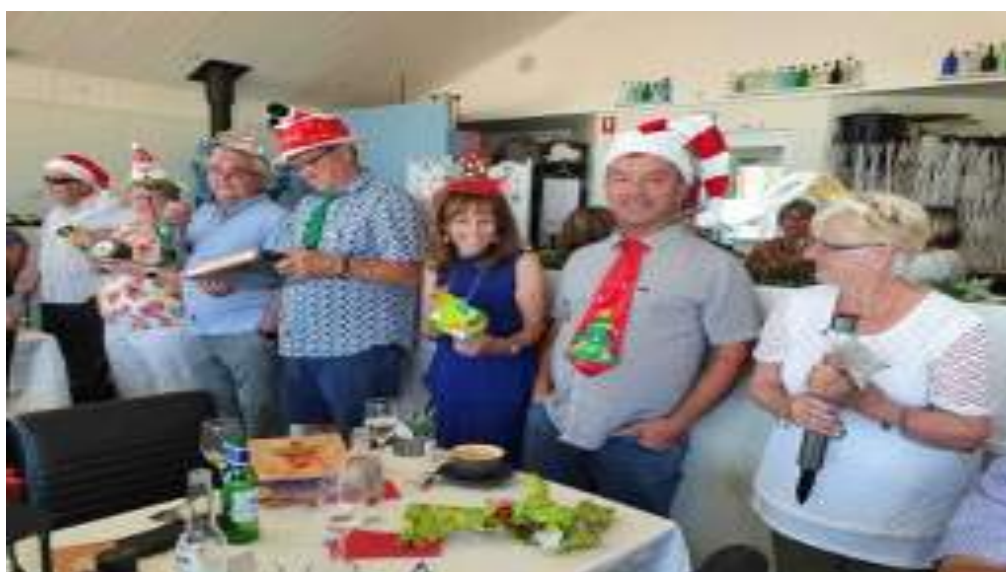
No prizes for who has been naughty or nice in this photo!

The organisation at the café was very good. We had tickets giving our name and what we ordered. I was told this was to help the staff, ok but perhaps it was to help us. A delightful meal followed by coffee. A drink or two and lo and behold here comes Father Christmas with a sack full of pressies. Excitement abounds, what can you get from Bunnings?