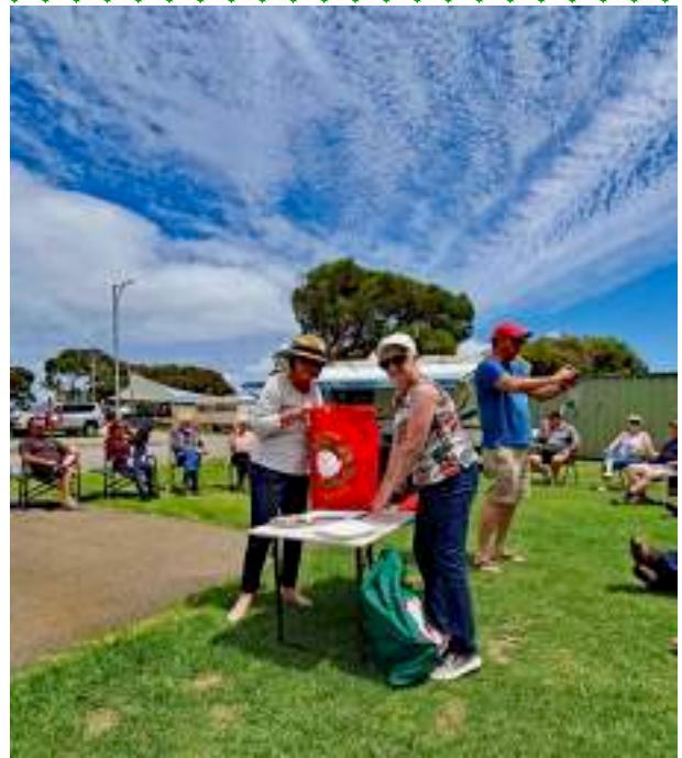
Santa's elves preparing for the festivities to come.

Eaton is a lovely little spot to take a drive along the estuary. We saw several hundred black swans on the water and a lot of kangaroos. Father Christmas was spotted relaxing outside a log cabin. Was he getting ready to visit the Sandgroper's at Back Beach?